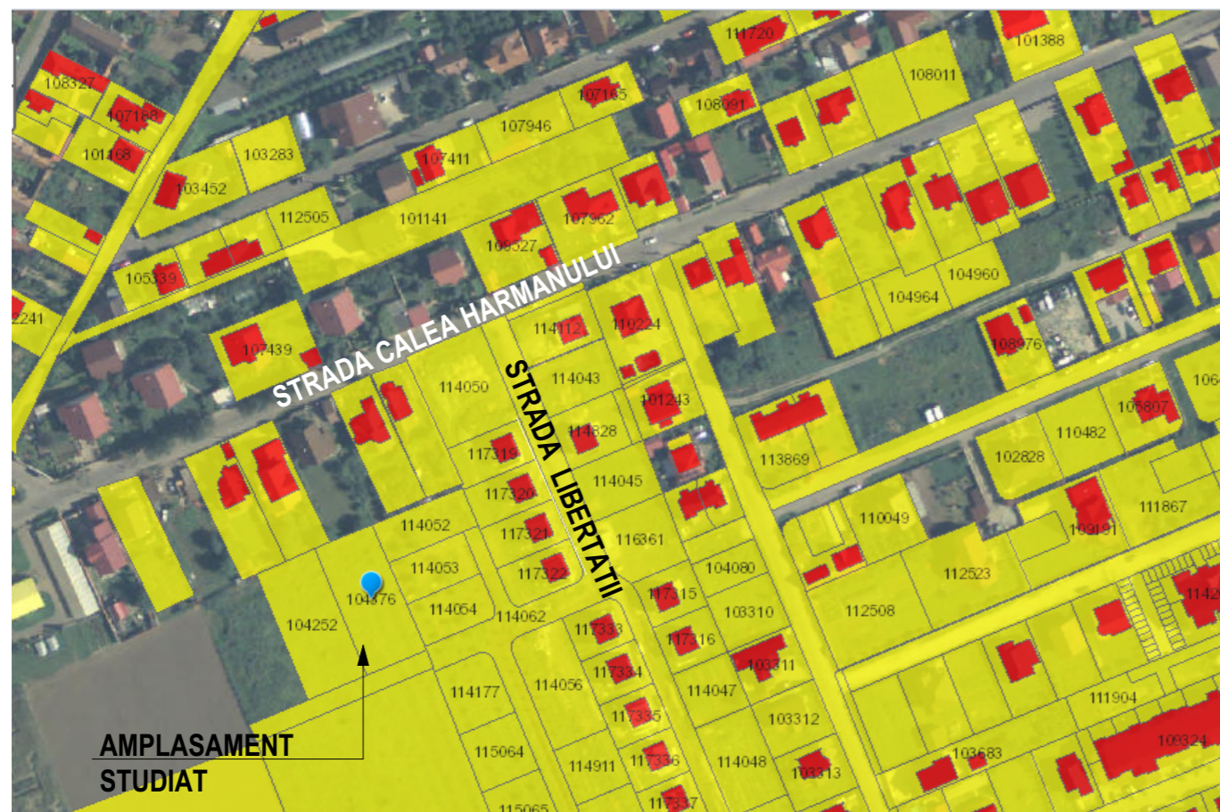
incadrare Imobile eterra